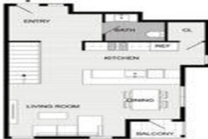
UNIT 304 MAIN LEVEL